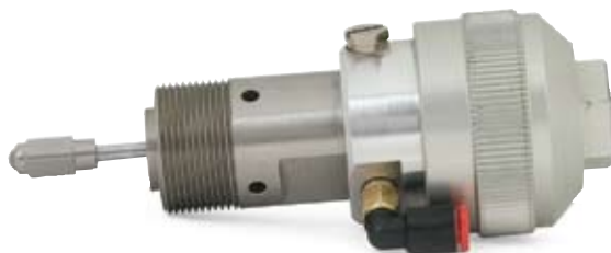
High Pressure Color Valve